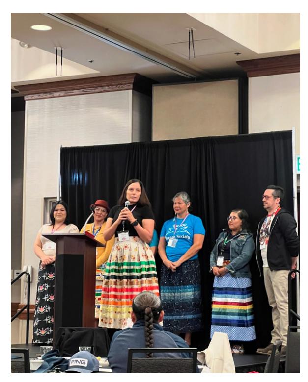
Unite to Shine Your Light Dineh and Lakota peoples organized for over a year.